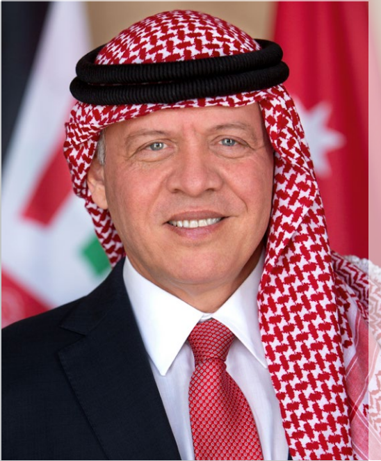
His Majesty King Abdullah II Ibn Al-Hussein